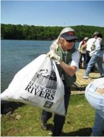
Bankhead Lake Cleanup at Quinns Landing on June 1.