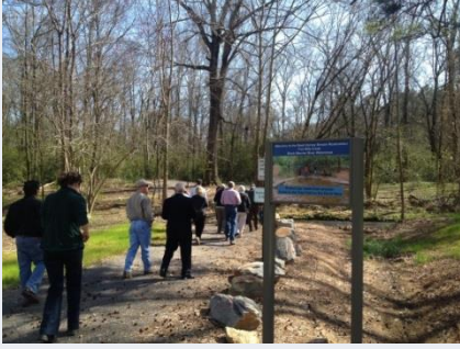
A group touring Reed Harvey Trail on March 14, 2013