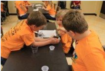
Students learn about filtration at the first annual Chilton County Water Festival

With help of a small grant from Cawaco RC&D, the Chilton County Soil & Water Conservation District was able to hold the First Annual Chilton County Water Festival. Held on March 15, 2013, the festival educated over 650 students about the importance of water quality and conservation. Seventy volunteers signed the registration Friday morning to help. The planning for 2014 begins very soon!