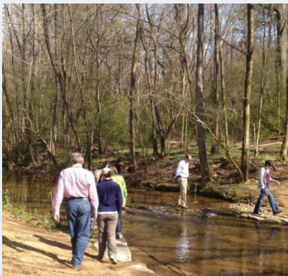
Crossing Five Mile Creek over a constructed rock vane.

Cawaco recently completed a 5 Star Restoration grant with the National Fish and Wildlife Foundation . Location: Center Point, Alabama. T 16 South R 1 West Section 18 between 22 nd Ave NE and Polly Reed Road This Five Star Restoration project enhances stream habitat using natural channel design. The rock vane structure also doubles as a crossing to the nature trail. Once you cross the water on the stepping stones, follow the crushed rock trail along Five Mile Creek to find six different kinds of trees. Enjoy this wooded nature trail and learn about walnut, willow oak, sycamore, black willow, sweet gum and box elder and how people use the wood. These trees once filled central Alabama's broad floodplains along creeks and rivers.