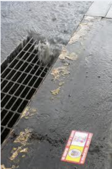
The "Water Runs Down Hill" Public Service Announcement is free to download and distribute. This PSA targets the general public and addresses common threats to our fresh water supply.