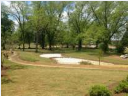
After: The area behind the Library facing Orr Park after construction of the bioswale and installation of the rainwater harvesting system.

Problem: Since the opening of the Library in 2007, increase in the volume of stormwater had resulted in serious, unsightly erosion in the area parallel to the Island Street side of the library building and flooding at the lower end of the library grounds.