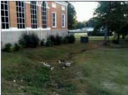
Before: Area directly behind the Library.