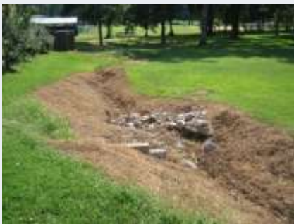
Before: Drainage ditch flowing towards Orr Park Brigde.