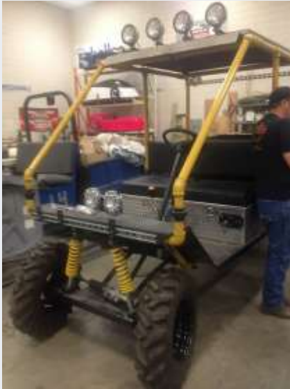
A Basic Utility Vehicle designed by students will be sent to another country to be used as an ambulance. A single grant from Cawaco years ago has made a worldwide impact.