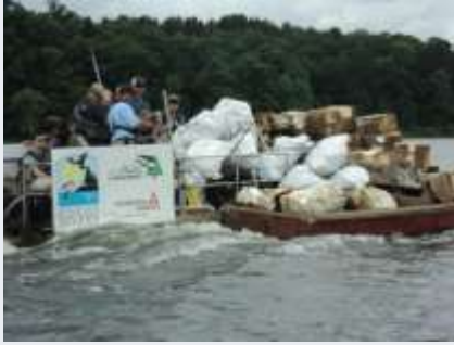
RenewOur Rivers Bankhead Lake Cleanup took place June 1.