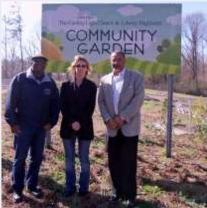
In April, Cawaco and Coosa Valley RC&D councils partnered to provide technical assistance and funding to the Guiding Light Church community garden which is located on John Rogers Parkway in Irondale, AL. Cawaco provided the funding and Coosa Valley's assistance included formulating a plan to increase production of the garden using micro-irrigation and installing best management practices in order to control soil erosion on steep slopes.