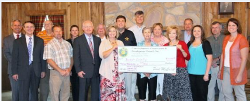
Blount County Grants announced at Cawaco Board meeting in August