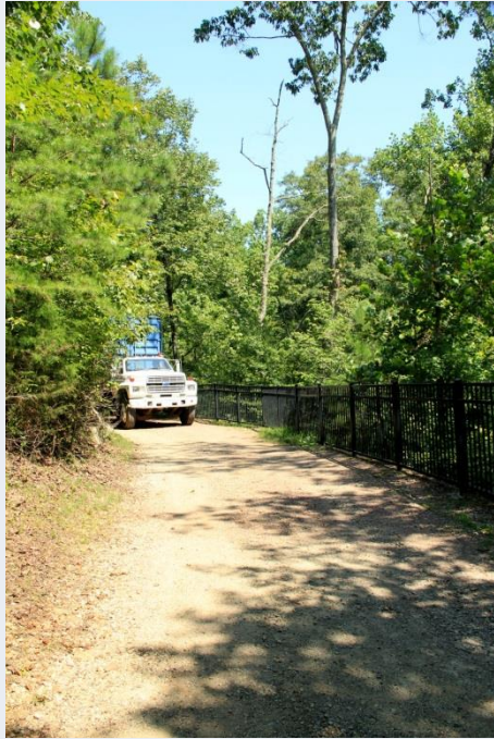
The Alabama Forestry Commission moved the units on July 30, 2013