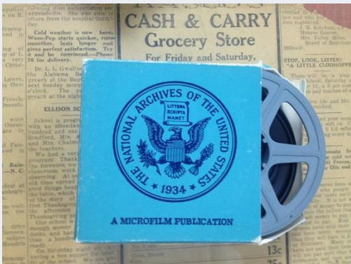
Historical data is preserved through a grant from Cawaco RC&D