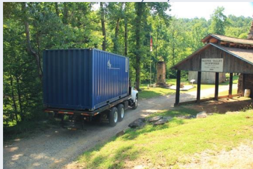
Some of the roadways were very narrow