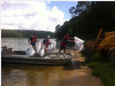
A group of eager volunteers braved the heat to clean up Holt Lake on August 10.