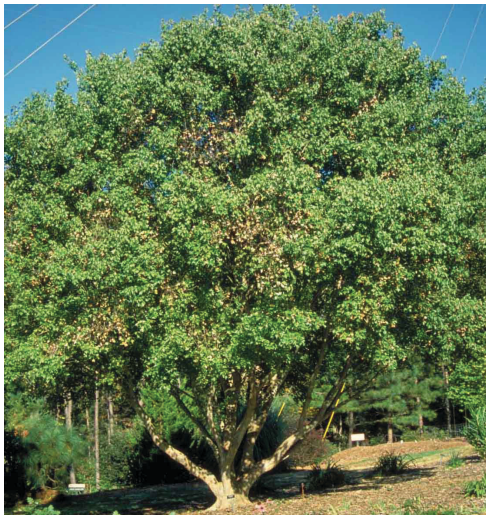
Figure 1. Mature Acer buergeranum : Trident Maple Credits: Ed Gilman

This deciduous, 30-to 45-foot-high by 25-foot-wide tree has beautiful 3-inch-wide, tri-lobed leaves, glossy green above and paler underneath, which turn various shades of red, orange, and yellow in autumn. Flowers are bright yellow and showy in the spring. Trident Maple naturally exhibits low spreading growth and multiple stems but can be trained to a single trunk and pruned to make it branch higher, allowing passage below its broad, oval to rounded canopy. With its moderate growth rate, attractive orange-brown peeling bark, and easy maintenance, Trident Maple is popular as a patio or street tree and is also highly valued as a bonsai subject. Crown form is often variable and selection of a uniformly-shaped, vigorous cultivar is needed.